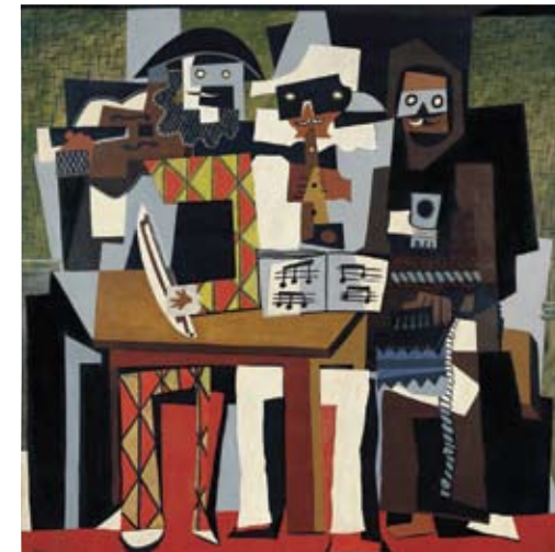
MODERN AND CONTEMPORARY ART