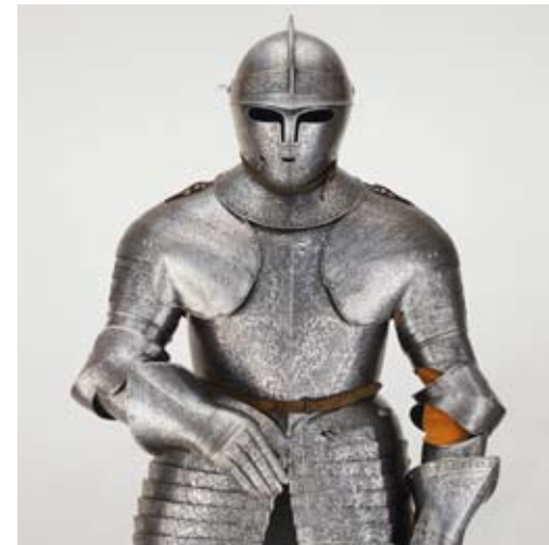
ARMS AND ARMOR