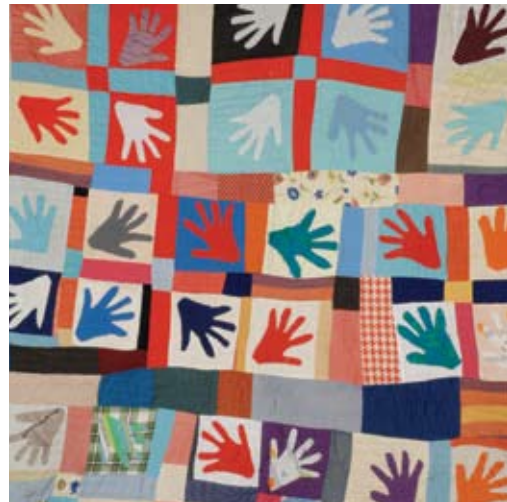
COSTUME AND TEXTILES