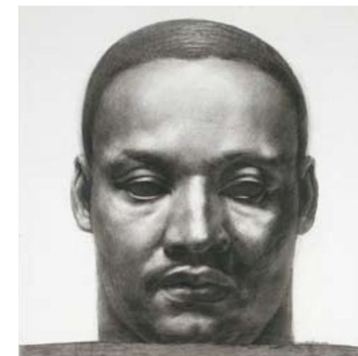
PRINTS, DRAWINGS, AND PHOTOGRAPHS