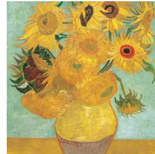
EUROPEAN ART 1850–1900

The PHILADELPHIA MUSEUM OF ART is among the largest museums in the United States, with more than 200 galleries showcasing over 2,000 years of exceptional human creativity in painting, sculpture, works on paper, photography, decorative arts, textiles, and architectural settings from Asia, Europe, Latin America, and the United States. An exciting addition is the newly renovated and expanded PERELMAN BUILDING, which opened its doors in September 2007 with five new exhibition spaces, a soaring skylit galleria, and a café overlooking a landscaped terrace.