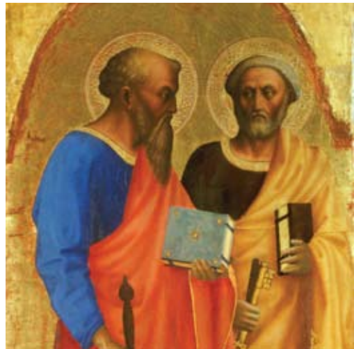
EUROPEAN ART 1100–1850